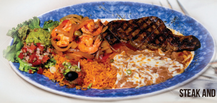
STEAK AND SHRIMP