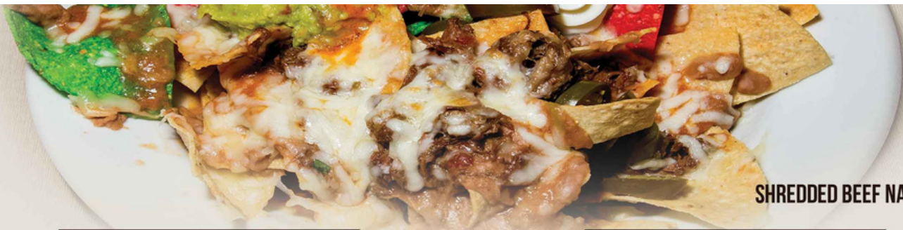
SHREDDED BEEF NACHOS