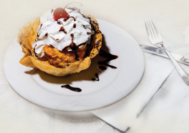
DEEP FRIED ICE CREAM